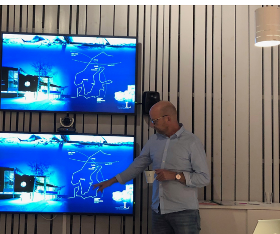
Above: Visit to the university of Lulea Below: Visit to Lulea Energi AB, local distributor of central heating and cooling.

In the competition international student groups will compete. They will present their ideas on how to reduce energy consumption using The sustainable Canvas Business Model.